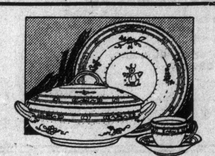
French Noble Service Beautiful quality Coalport china, handsome new border decoration (as illustrated). Full 112-piece dinner service. October china sale ....

England's most famous make of highgrade china. Pretty green ribbon and dainty rosebud border decoration. Coin gold striped handles and edges, 100 pieces. Regular $125.00. October china sale price ..... 89.50