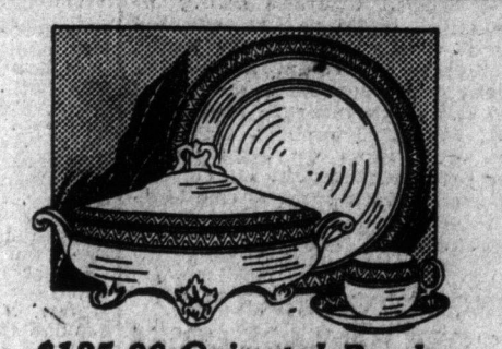
$125.00 Oriental Border

Bernardaud & Co.'s Limoges French China, gold band border with pretty black Greek key over design. Full coin gold handles. 102 pieces. Regular $125.00. October china sale, Thursday, the set ..... 82.50