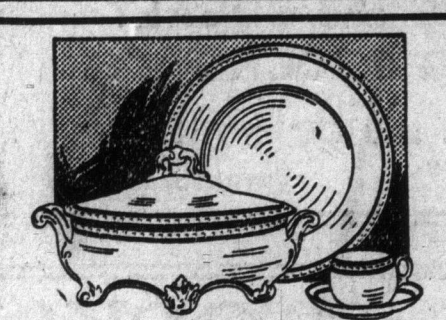
A Limited Number of Savoy Dinner Sets, Regular $59.50, Thursday, $36.75