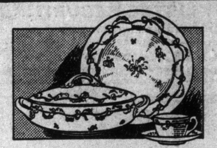
$125.00 Coalport Ribbon Service, $89.50

England's most famous make of highgrade china. Pretty green ribbon and dainty rosebud border decoration. Coin gold striped handles and edges, 100 pieces. Regular $125.00. October china sale price ..... 89.50