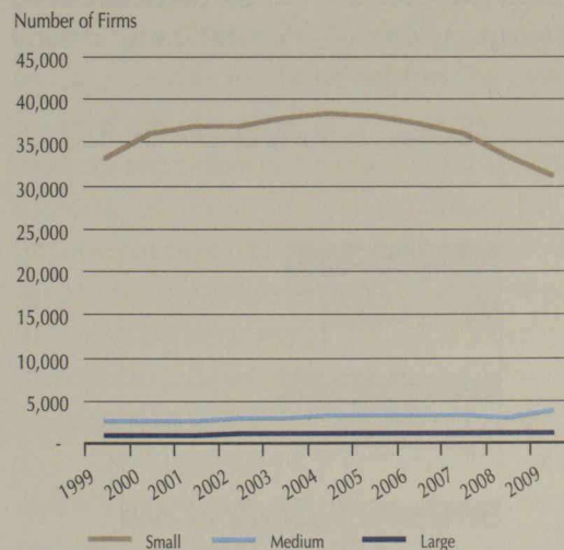
Number of Exporters, by Firm Size, 1999-2009

Source: Statistics Canada, Exporter Register.