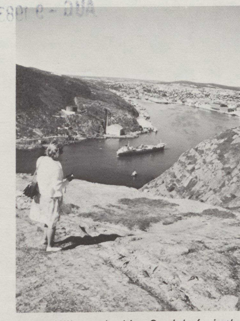
Signal Hill, overlooking St. John's, is the point where Marconi received the first transatlantic Morse code message.

inviting coves have been a haven for sailors from ancient times. As early as the eleventh century, the Vikings founded a settlement there. Then in 1497, it was rediscovered by John Cabot, a Genoese sailor commissioned by King Henry VII of England. Later it became a temporary base for the many European fishing fleets attracted by the abundance of fish off its shores. The island remained unclaimed until 1583 when Sir Humphrey Gilbert took possession for Queen Elizabeth I of England. Representative government was granted in 1832 and responsible government 23 years later.