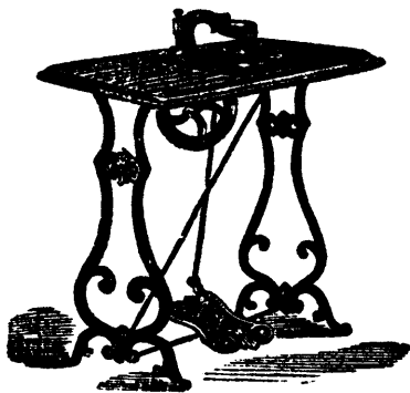
Plain Machine Complete. Price $25.00.