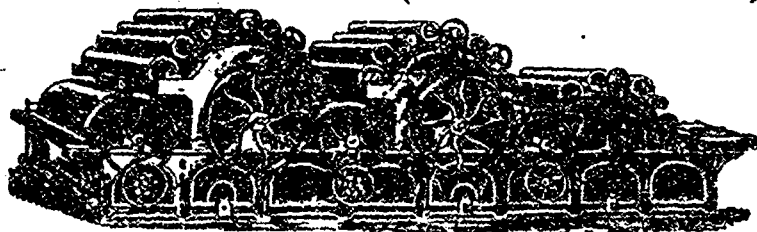
English Sales Attended.

Condenser Aprons Buffed Surfaces Plain & Grooved