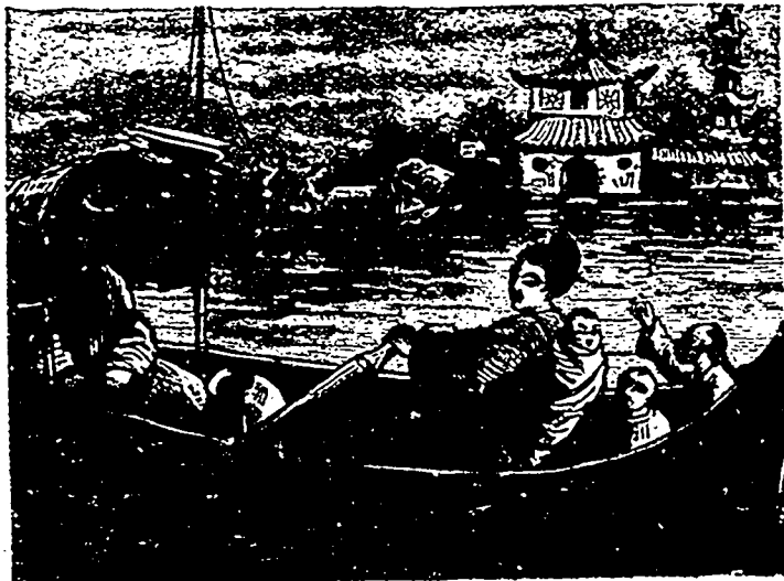
BOAT SCENE IN CHINA.

"Germany," says St. James' Gazette, "has had five sovereigns since Queen Victoria began to reign. She herself will in future be recognized as the ancestress of one of the most powerful rulers. Her grandson wears the Iron Crown of Germany. Her granddaughter is Empress of Russia. Another granddaughter is the Crown Princess of Roumania. Her second son rules over the Principality of Saxo-Coburg. The Hereditary Princess of Saxo-Meinigen is her granddaughter. The heir to the throne of Greece is her descendant, the Grand Duke of Hesse is her grandson. She has no fewer than sixty-one descendants who one day between them promise to be at the head of more than half of Europe."