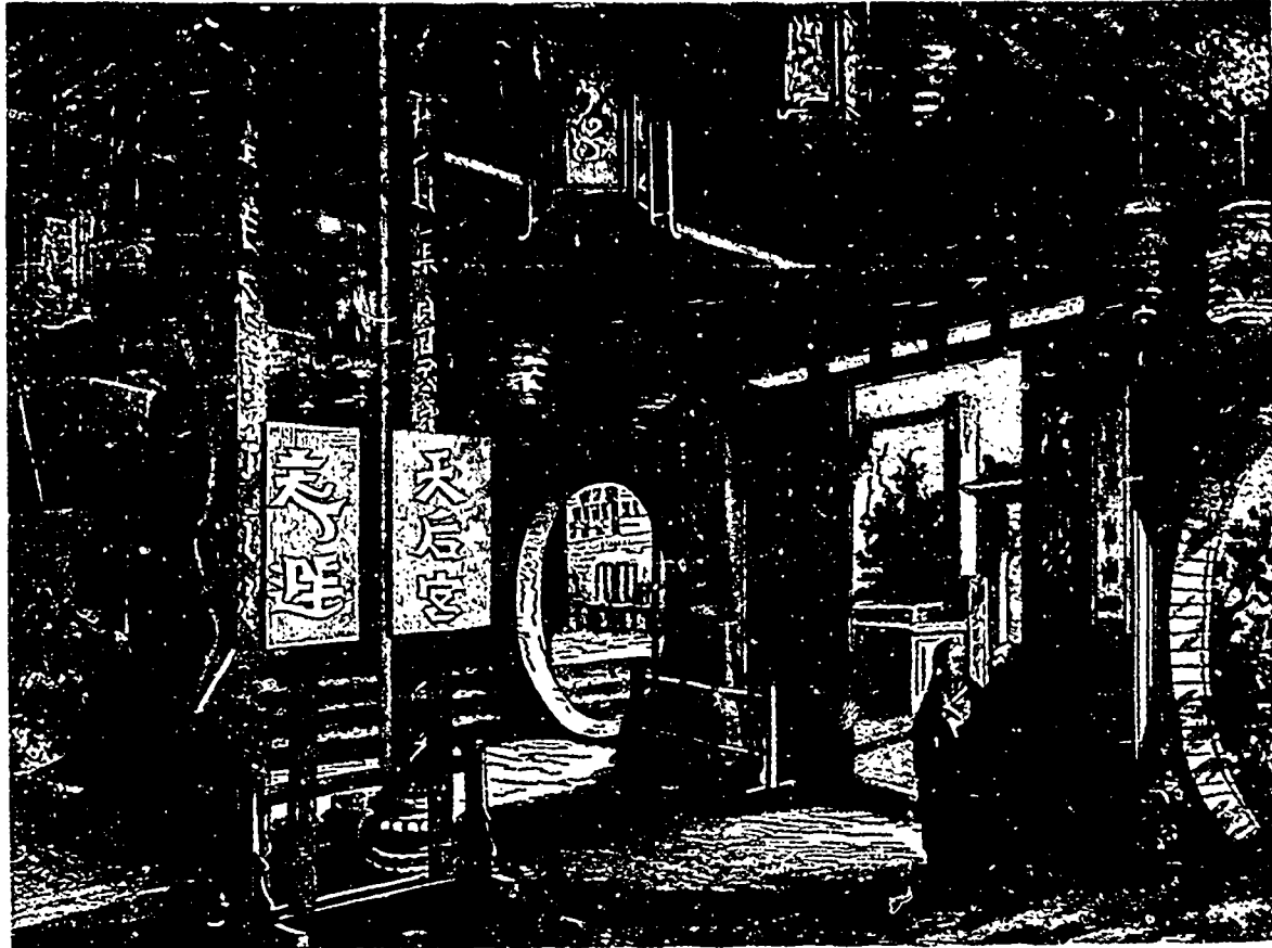
RECEPTION ROOM, CHINESE MANSION.

The Chinese are a very hospitable, and a very polite people. They are very fond of entertaining their friends, and the rich folk entertain them most magnificently. They are very profuse in their salutations and compliments. The mansions of the rich are often situated in the midst of elegant gardens, and are adorned with very great taste. In the engraving, we are shown the interior of one of these mansions. It will be observed from the size of the figures how lofty and spacious the apartment is. Through the latticed doorway and the large oval windows, without glass, is caught a glimpse of the beautiful gardens without. The numerous and elegant lanterns hanging from the ceiling will attract attention. When these are all lighted at night, the effect must be very beautiful. The sentences inscribed in gold or vermilion letters are for the most part moral maxims or proverbs, of which the Chinese are very fond. An artist will be seen copying the extraordinary