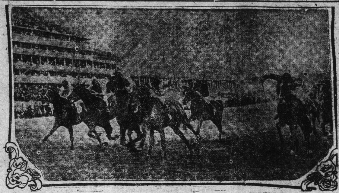
The running of the Derby, showing how Craganour crowded Aboyer and was disqualified.