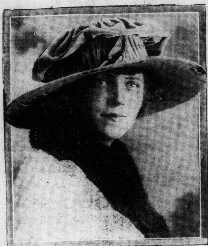
Lovely new Smolin "Blue Bird" model of the new shade of cerise panna velvet with facing of Alice Blue. Shirred Tam-o-Shanter crown and ornaments of jet, and collarette of Kelinsky and ermine adds to the attractiveness of the hat.