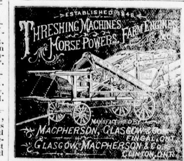
Send for illustrated Circulars and Price List