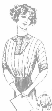
7148 Fancy Tucked Blouse, 34 to 40 bust.