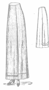
7157 Six Goved Skirt with Panels for Misses and Small Women, 14, 16 and 18 years.