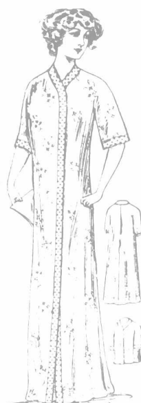
7163 Long or Short Kimono, Small 34 or 36, Medium 38 or 40, Large 42 or 44 bust.