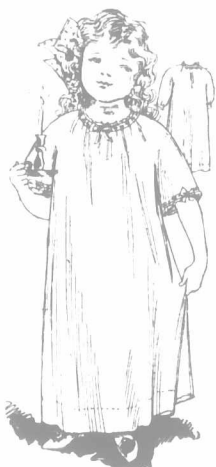
7151 Girl's One-piece Night Gown, 4 to 12 years.