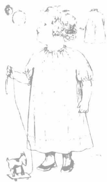
7165 Child's Bishop Dress, 6 mos., 1 and 2 years.