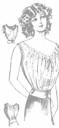
7120 Two-Piece Cover for Misses and Small Women, 14, 16 and 18 years.