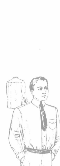
7164 Men's Outing or Negligee Shirt, 34 to 46 breast.

Please order by number, giving age or measurement, as required, and allowing at least ten days to receive pattern. Price, ten cents per pattern. Address, Fashion Dept., "The Farmer's Advocate," London, Ont.