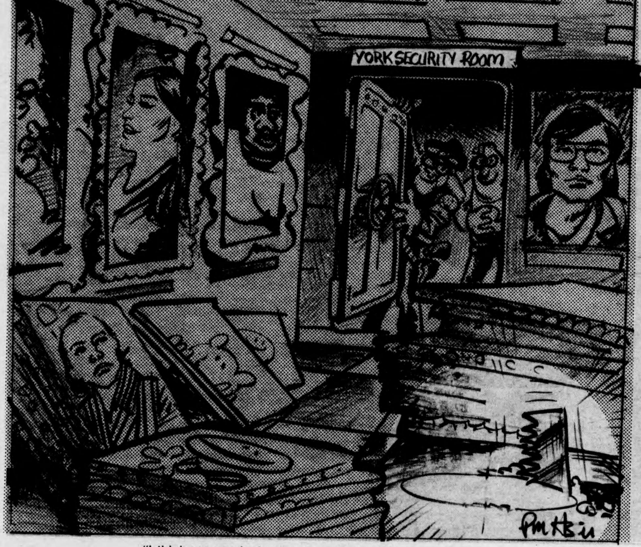
"I think we can lock up now - the paintings are safe."

All letters should be addressed to the Editor, c/o Excalibur, room 111 central Square. They must be double-spaced, typed and limited to 250 words. Excalibur reserves the right to edit for length and grammar. Name and address must be included for legal purposes but the name will be withheld upon request.