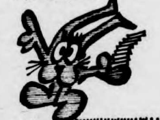
little lappy, showing a propensity for pecuniosity and velocity simultaneously.

now lappy was short of cash. this isn't surprising, because we would be hard put to advertise this way if she weren't.