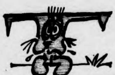
Lapinette, demonstrating her desire for carrotic cupcakitude.

but such culinary consummations call for capital.