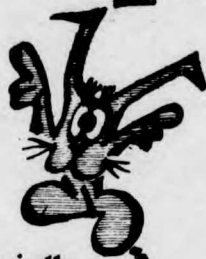
Lapinette, illustrating her short hop technique.

One day our lapyary friend was busy making a short hop across campus when she espied a truck transporting copious quantities of carrot cupcakes.