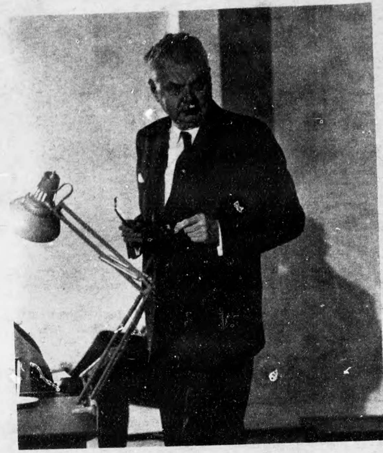
Who knows? Maybe Dief' will become the next editor. Rumour has it that he is on the market for a new job. It is felt that his political background will be of great assistance in controlling the unknown photograher