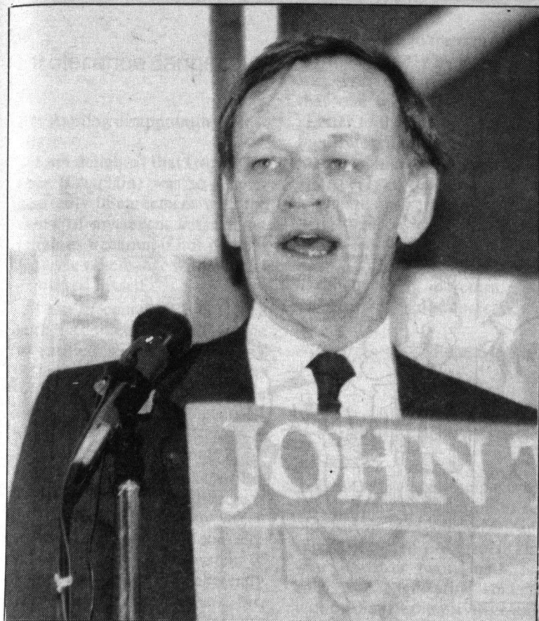
Jean Chretien displays his famous facial form while speaking to Lister residents during breakfast last Thursday at 6:00 am.