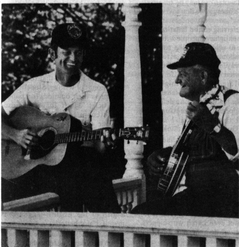
Jack Daniel's Tennessee Whiskey is represented in Canada by FBM Distillery Ltd., Brampton, Ontario

week, during their annual Bannone hoe-down, the Aggies trucked in 350 bails of straw to help set the scene for their week of good 'ol boy festivities. The party favours spread out of control however. During their promenade through the campus