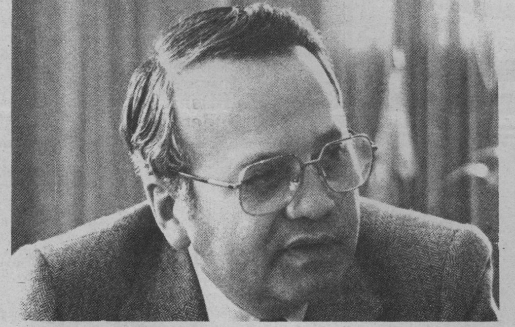
"I don't think we should pretend a university is involved only in general liberal education."

I'm very hopeful we will receive the kind of support, not only from government, but from the community in general, which will enable us to be something more than just another college or university. We have the capability to do things at such a standard to justify our considering ourselves, and being considered by others, as one of the top two or three institutions in this country. That is my modest desire for my term. If we can be further along in four or five years than we are today, I will feel I've accomplished something.