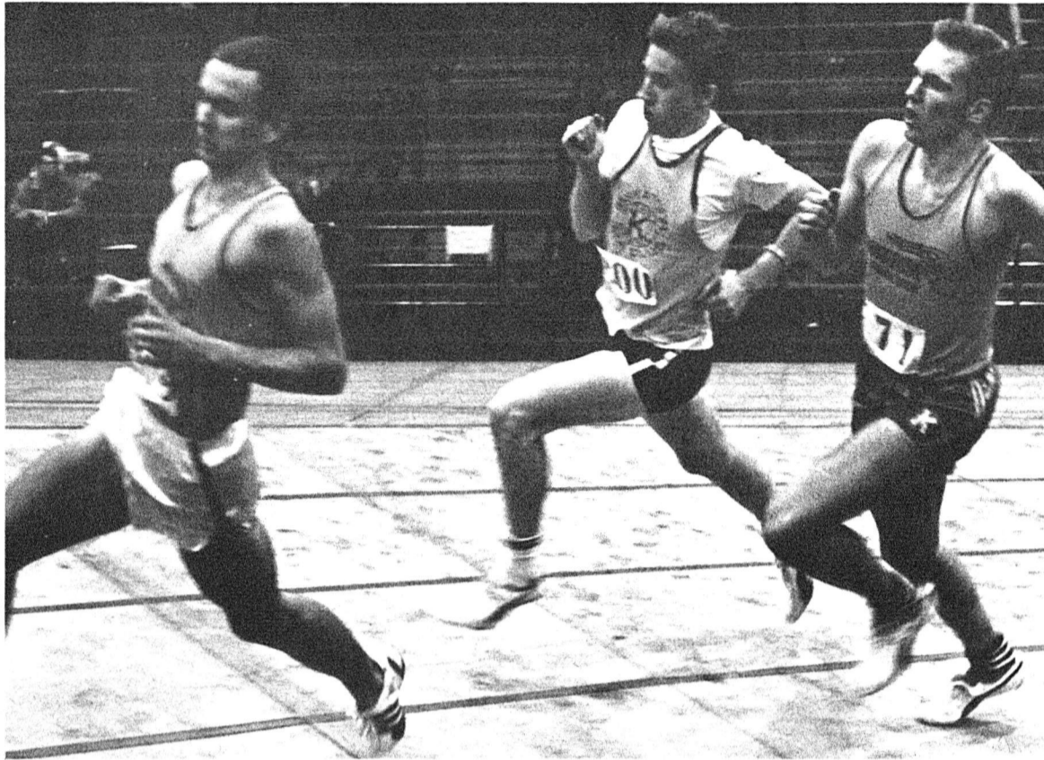
AROUND AND AROUND WE GO