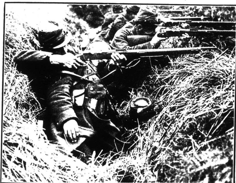
In the Firing Line of the French Army. A soldier defending a wounded comrade and at the same time obtaining a firm support for his rifle. A scene often witnessed in the present struggle.