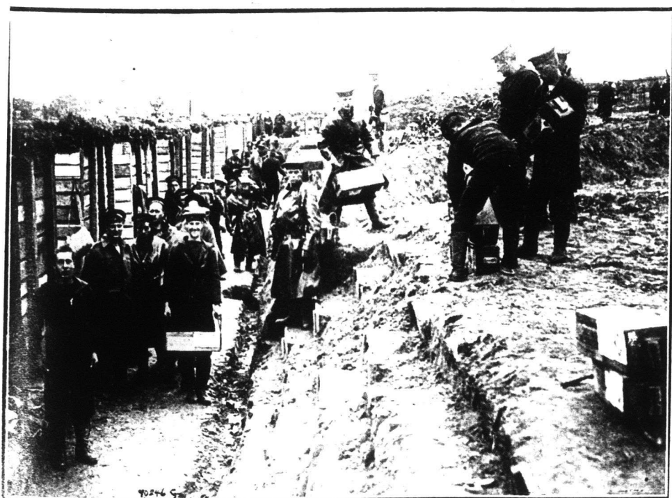
British Marines carrying ammunition into the trenches near Antwerp. A detachment of the British Marines landed at Antwerp a few days before its evacuation.