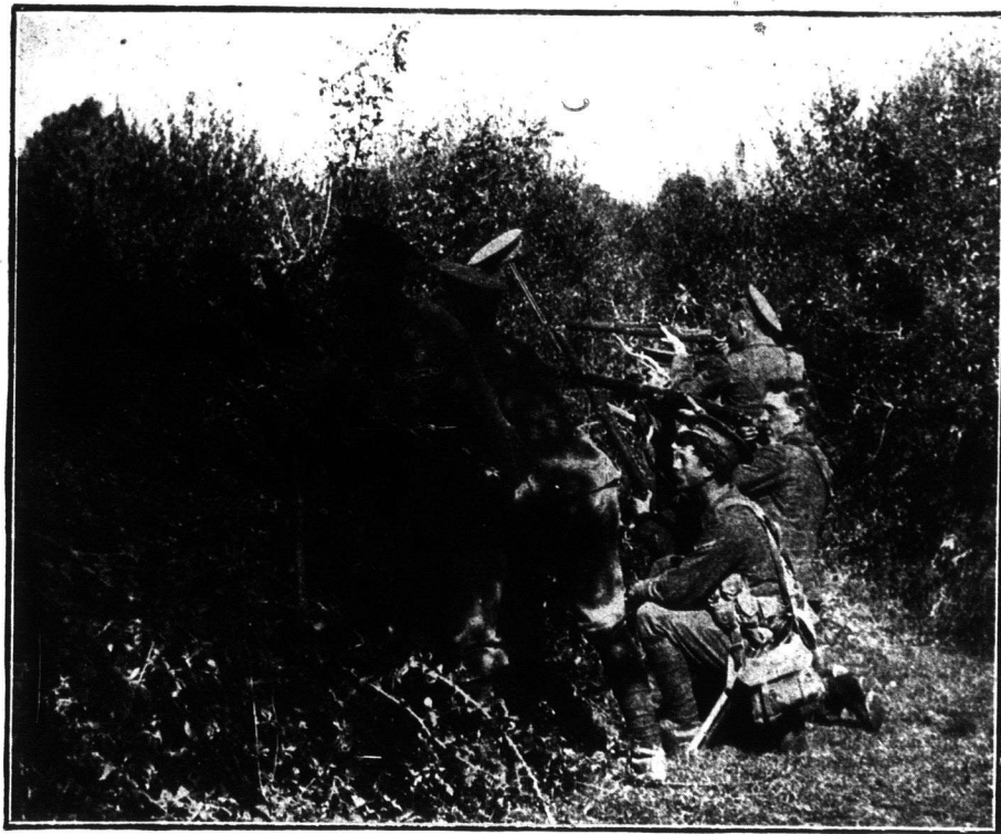
British Outposts on the lookout for the enemy. The men display wonderful cleverness in concealing their whereabouts. The British soldier has shown unequalled genius as a scout.