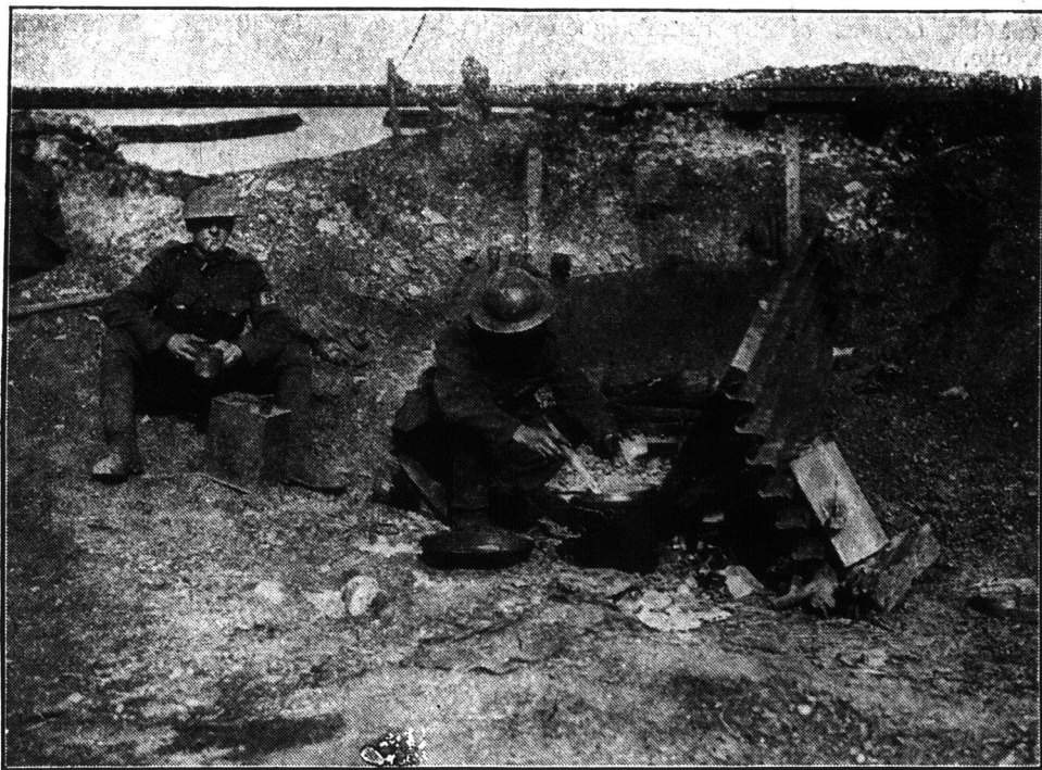
Canadian cook making tea in the line. A stretcher bearer is waiting for his share.

If grown people choose to go to bed with cold feet, "what's to hinder?" Maybe they agree with the irascible old man who, having tried various liniments and emollients without effect, at last defied the offending member: "Ache away, old fellow, I can stand it as long as you can." But to put into cold sheets feet that should be warm and rosy, but that are numb and blue, is enough to make all the toes this side of the tropics curl. Some have constitutionally cold feet, that will be cold in spite of woollen stockings, and thick shoes, and any amount of exercise. The nervous system of children is said to be five times greater proportionately than that of their elders. Who can doubt it? And certain restless specimens, common to every neighborhood, should be, in justice to ordinary two-footed urchins, ranked as human decapods; for how can one pair of feet accomplish all these juvenile Fliakims do? But bed-time rolls around, and then the tired limbs, the yielding bones of the growing body, should lie in happy unconstraint: knees and chin should not be brought into unnatural and uncongenial neighbourhood.