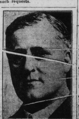
Wm. Watson, The English Poet.

Indian Recruits. Recruiting for the Indian army is continuing in an extraordinary manner, the fighting ranks having had their martial instincts considerably whetted by accounts of feats achieved by the Indian troops at the front. In consequence of the number of applications received at headquarters for permission to proceed to the front the commander-in-chief of the Indian army has been obliged to forbid officers to forward such requests.