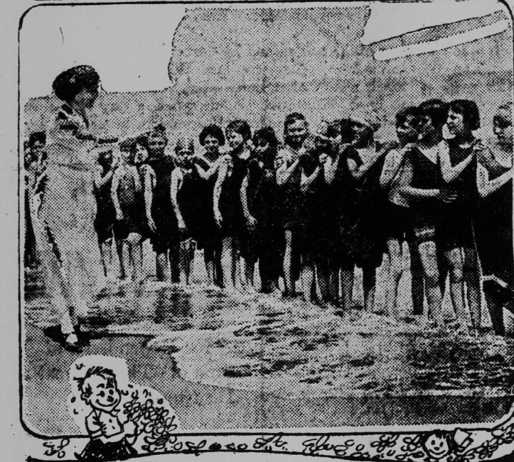
ABOVE ALGHETTO CHILD WITH HERIARMS FULL