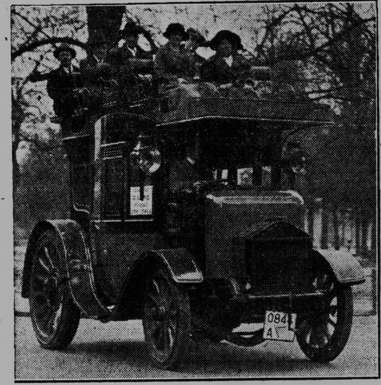
Much comment has been caused by the appearance of this strange vehicle in the streets of London, England. It resembles one of the famous coaches of Dick Turpin's time, but a motor replaces the picturesque horses and post-boys.

YE OLD STAGE COACH TURNED INTO MOTOR 'BUS