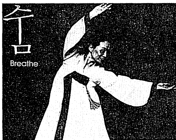
Korea's Chang Mu Dance Company

The Chang Mu Dance Company, Korea's premier contemporary dance and drumming ensemble, began a cross-Canada tour on July 17 at the Michael J. Fox Theatre in Burnaby, B.C.