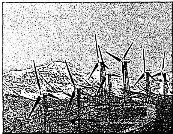
Energy Windmills in Alberta

Energy, whether it is used to fly a fleet of planes or light a city block, is the lifeblood of economic growth. The Asia Pacific region has made the world's most significant progress in