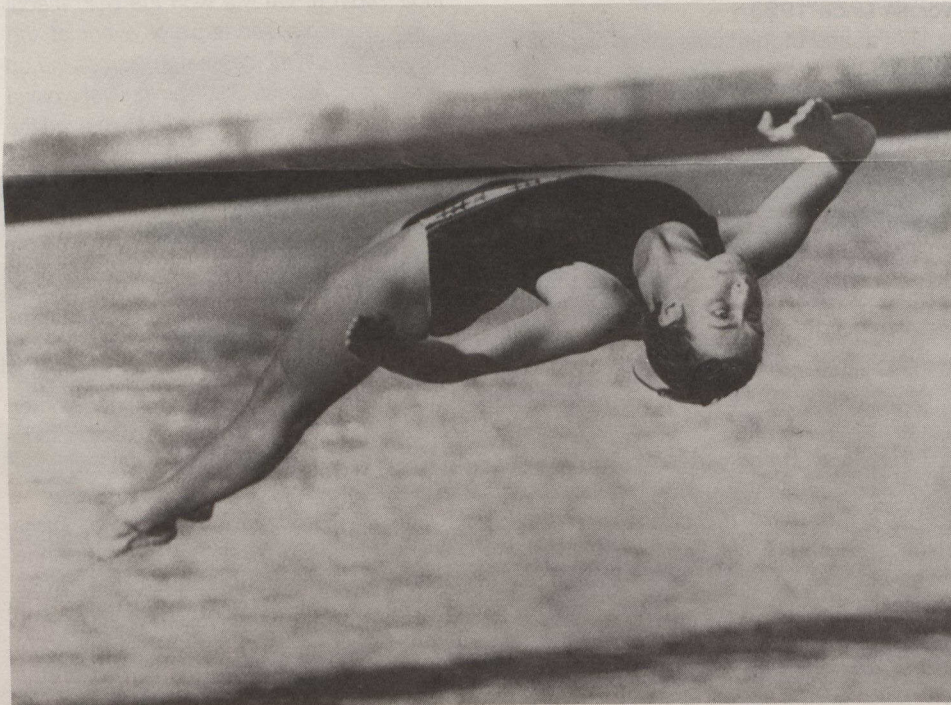
Gold-medal winner Sylvie Bernier displays perfect form in a reverse one-and-a-half with half twist in the springboard finals. She was Canada's first gold medallist in Olympic diving.