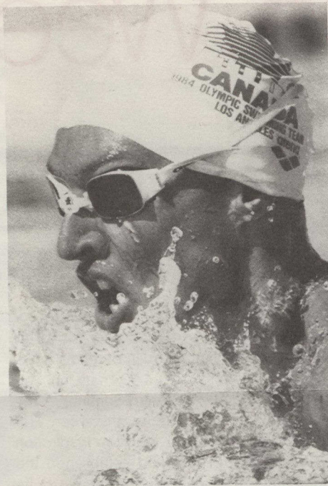
Two new world and Olympic records were established by Canada's Alex Baumann when he won two gold medals. He swam the 400-metre individual medley in 4:17.41 and the 200-metre individual medley in 2:13.34.

gold medallist winning the women's springboard event.