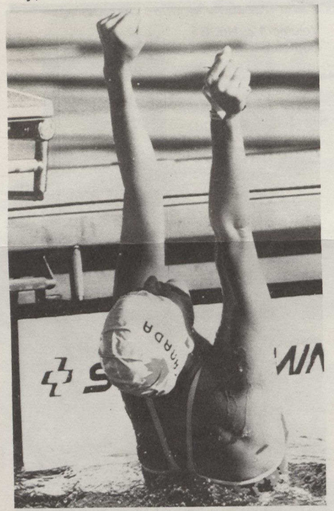
Anne Ottenbrite jumps for joy on winning the 200-metre breaststroke in a time of 2:30.38 to win an Olympic gold medal. She also won a silver in the 100-metre breaststroke and a bronze in 4x100-metre relay.

Also at the pool, Sylvie Bernier of Ste Foy, Quebec became Canada's first diving