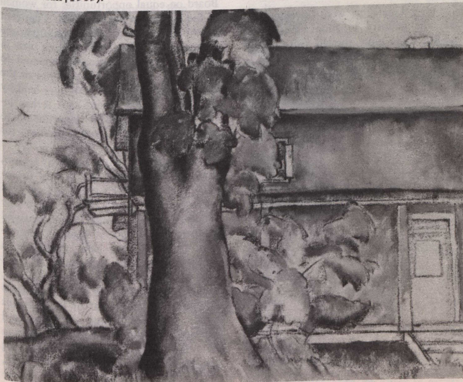
Rivière des Prairies, Quebec (1922).

The 101 examples of FitzGerald's work, which span his whole career, are an excellent cross-section of his drawings and watercolours, and major oil paintings. The National Gallery's permanent collection will be part of this major retrospective, including its first purchase of FitzGerald in 1918 entitled Late Fall, Manitoba (1917).