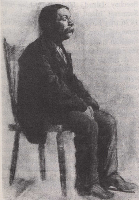
Seated Man (1909).