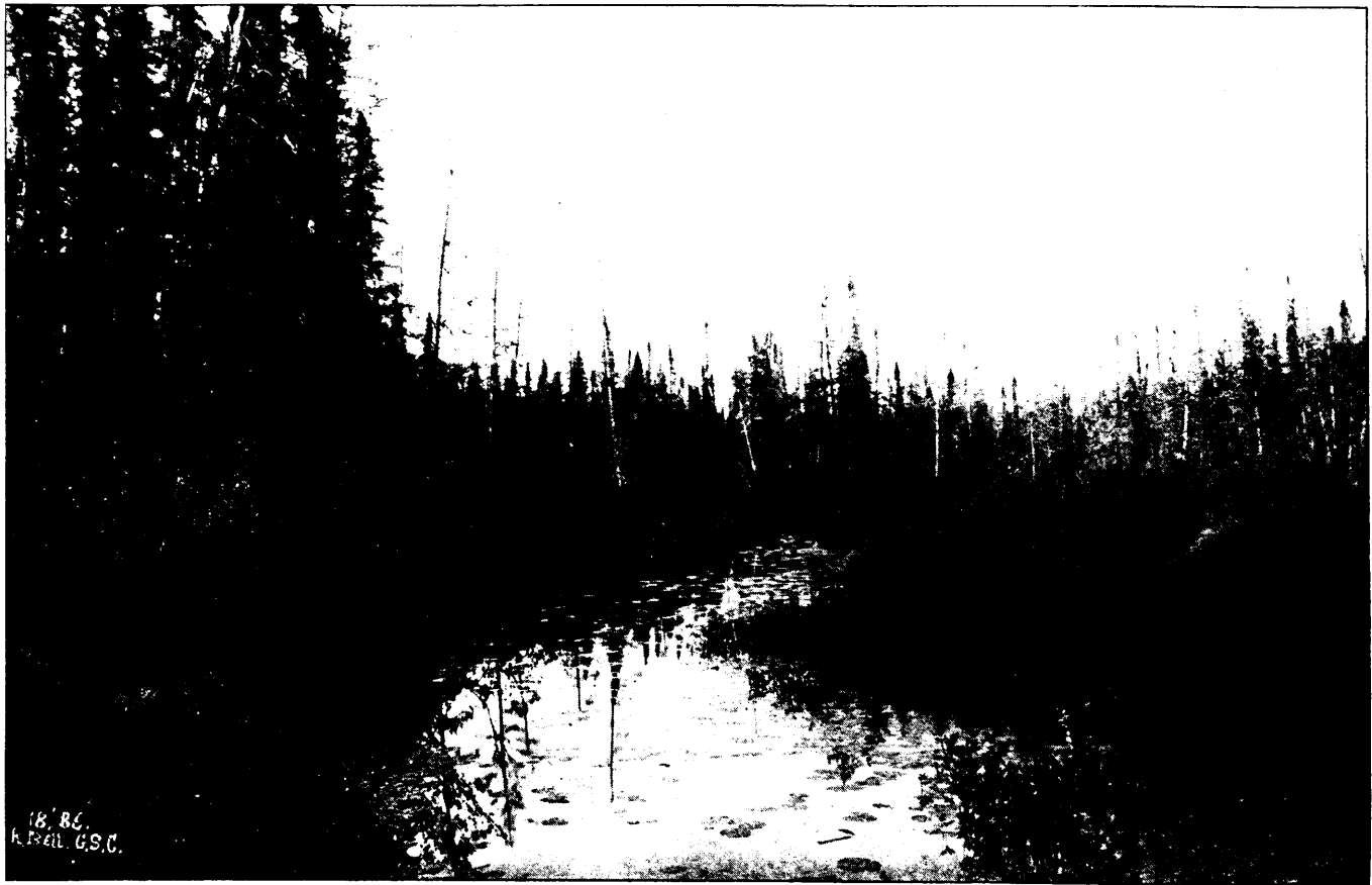
BOULDER RIVER, NEAR ITS SOURCE; Showing the general character of the Streams on the Height of Land, S. W. of Hudson's Bay.