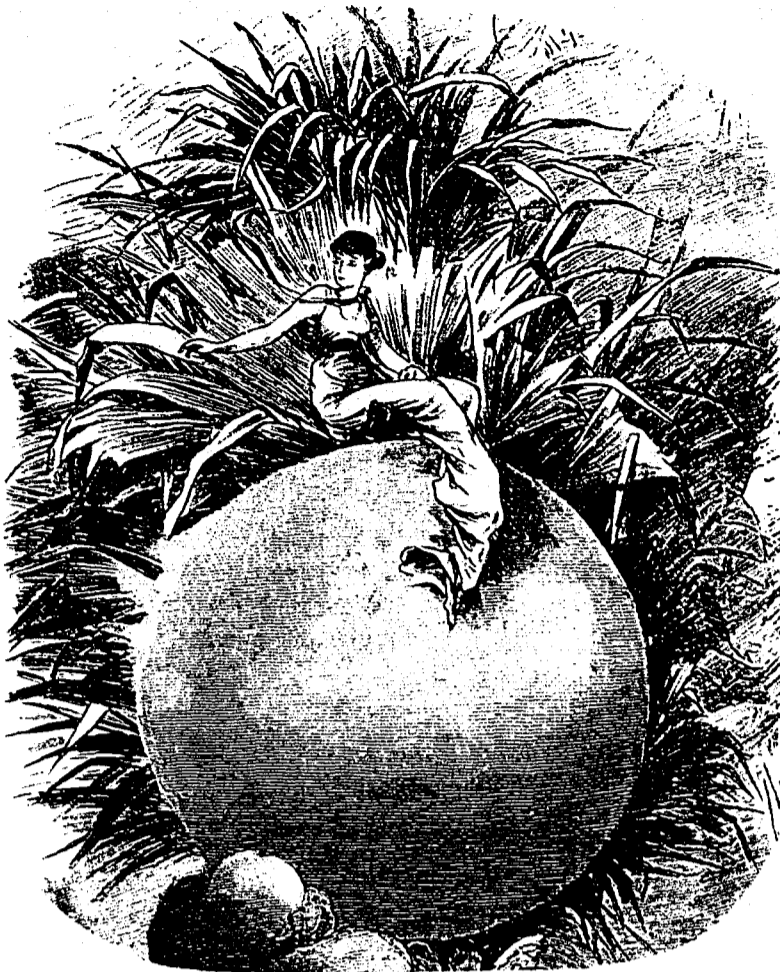
ART RULING THE WORLD.