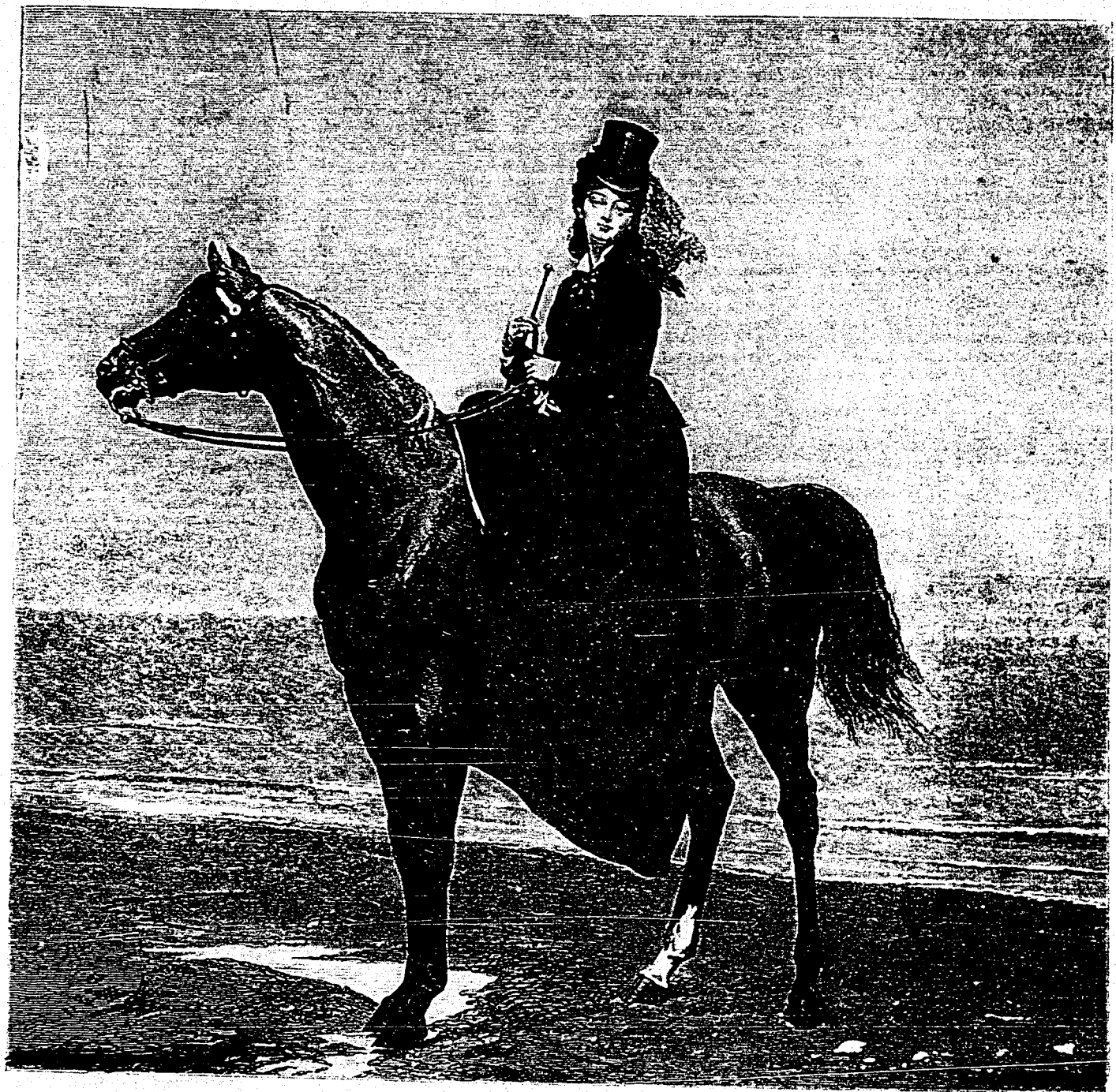
BY THE SEA SHORE.