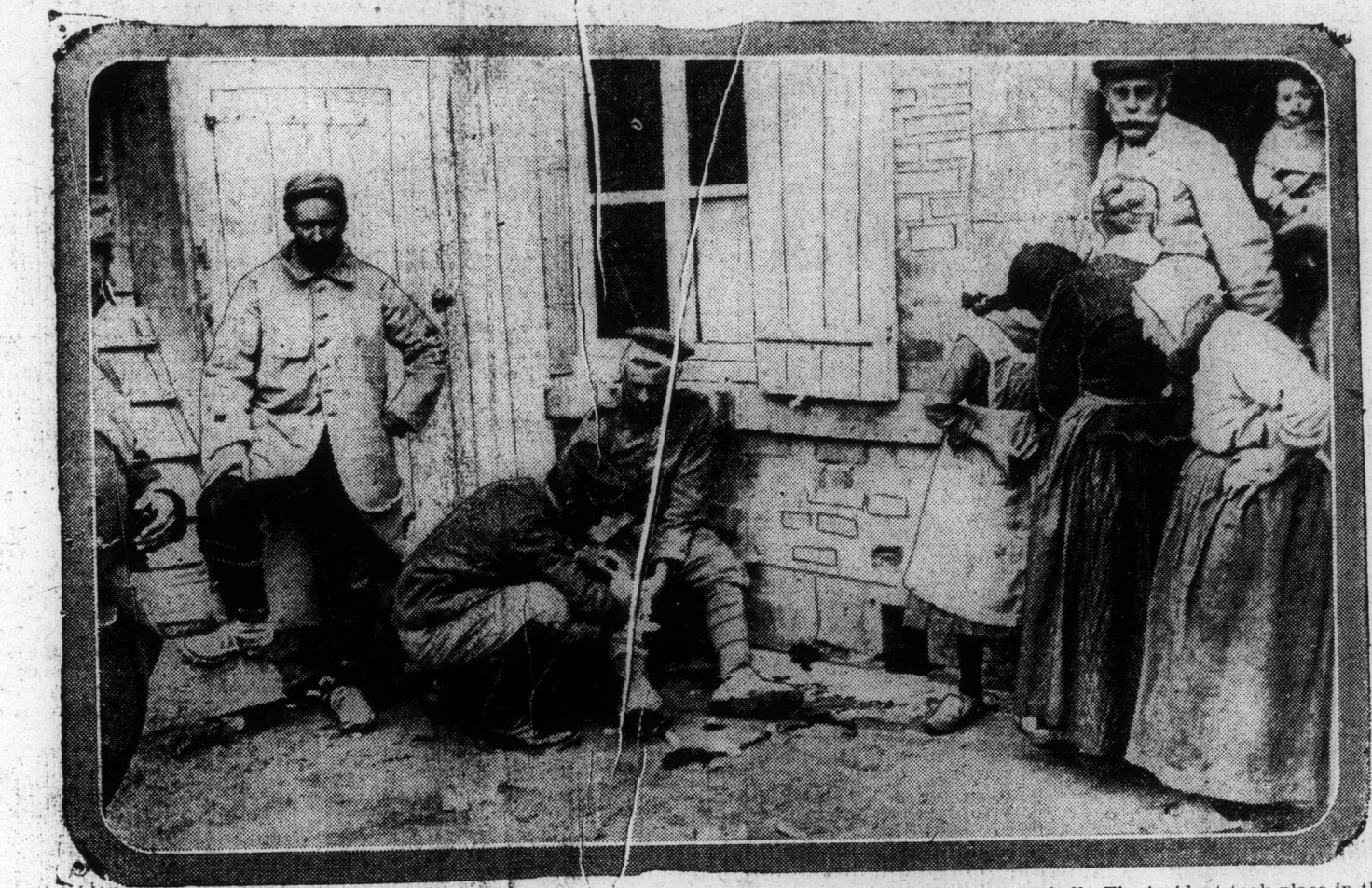
The photograph shows a French mayor binding up the wounds of a Germ an soldier who has been hit by a shell. The incident took place in the court house of a farmhouse at St. Elienne au Temple, France. Several Fren ch women are interested spectators. The fact that the German is wounded entirely changes his status in the eyes of the French spectators and they treat him not as an enemy but as one of them. They are just as careful to see that his life is saved as if he were one of their own boys.

FRENCH MAYOR BINDS WOUNDS OF AN INJURED GERMAN IN FARMHOUSE COURTYARD