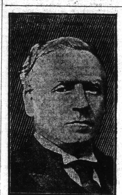
HERBERT H. ASQUITH,

The resignation of Sir Henry Campbell-Bannerban, the first Liberal Prime Minister of England since Lord Rosebery gave up office in 1895, has its dramatic phase, for as he passes from the stage, the mixed forces which he held together as a party appear also to be approaching the end of political power. The Bannerman government it has been stated, combined too many factions and too many fads; all the elements of opposition to conservatism well. That's the way most people feel and of discontent united to make comand when joined together in an administration, a working team of home rulperialists and "little Englanders" was found nigh impossible. But it speaks much for Bannerman's leadership that the disintegration of this party has gone on much more swiftly since the attack of heart trouble which occurred last fall in Bristol, where he went to make a political speech, practically removed him from further active leader-