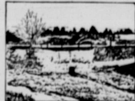
This view shows the Pedlar Culvert after the fill-in was completed. The Culvert has to carry a dead weight of several hundred tons of earth, as well as the live weight of traffic passing overhead. But that can't strain Pedlar Culvert, which will neither give nor spring. It stands what no other culvert can.