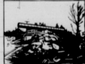
This picture of the Pedlar Perfect Culvert assembled and ready to lower into place, shows the immense strength and rigidity of these Culverts. Though forty feet long with a bearing of only a few feet at the center it does not give one-sixteenth of an inch. See how easily Pedlar Culvert can be lowered into place. No skill needed.