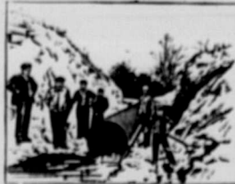
Here you see the Pedlar Culvert doing its work of drainage twenty-five minutes after being put in place. It would have taken three times as long and cost three times as much to have installed any other type of culvert. Yet this Pedlar Culvert will last far longer and give no further trouble of any kind.