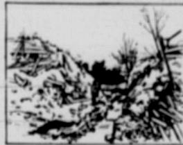
This picture is from a photo of a wash-out fourteen feet deep in the Township of Darlington, caused by use of cement tile for drainage purposes. The township authorities have replaced that with Pedlar Perfect Culvert, forty feet in length by three feet in diameter; strongest, easiest laid and most durable they could get.