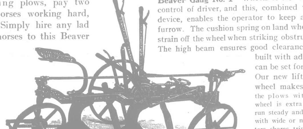
Cockshutt Beaver Gang

And this Gang Plow will make better furrows, plow quicker and save you nearly half your plowing expenses, than if you used two ordinary walking plows. Read all about it.