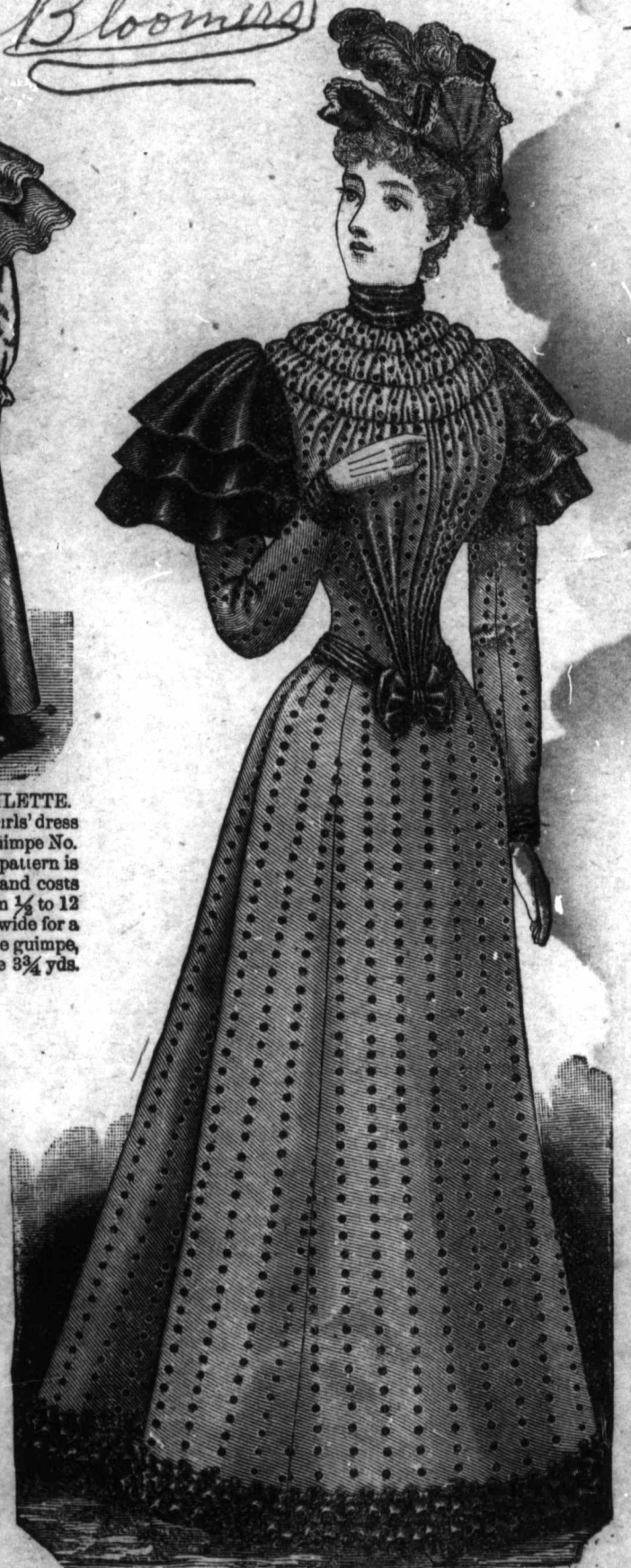
FIGURE No. 263 G.—LADIES' TOILETTE.

FIGURE No. 263 G.—This consists of Ladies' basque No. 6685 (copy-right), again shown on page 2 of this issue; and four-gored skirt No. 6690 (copy-right), also pictured on page 7. A delicate shade of blue batiste spotted with black is united with black Surah in the present instance. Lace edging could be attractively used for the caps on the sleeves and also to trim the skirt. The basque pattern is in 13 sizes for ladies from 28 to 46 inches, bust measure, and costs 25 cents. The skirt pattern is in 9 sizes for ladies from 20 to 36 inches, waist measure, and costs 25 cents. To make the toilette for a lady of medium size, needs 13 1/4 yards of material 22 inches wide; the basque requiring 6 yards; and the skirt 7 1/4 yards. If goods 44 inches wide be selected, then 6 3/8 yards will suffice; the basque calling for 3 yards, and the skirt for 3 3/8 yards.