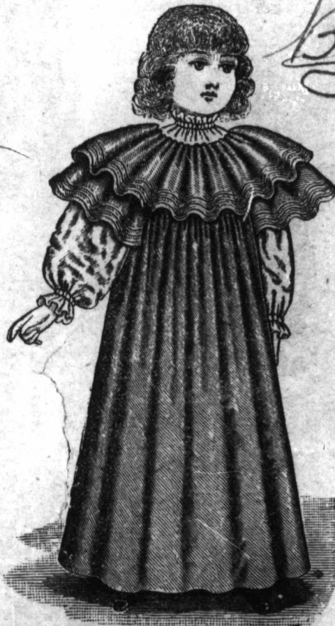
FIGURE No. 285 G.—LITTLE GIRLS' TOILETTE.

No. 6683.—This pattern is in 13 sizes for ladies from 28 to 46 inches, bust measure. For a lady of medium size, the jacket needs 7 yards of goods 22 inches wide, or 3 3/8 yards 44 inches wide, or 2 3/8 yards 54 inches wide. Price of pattern, 30 cents.