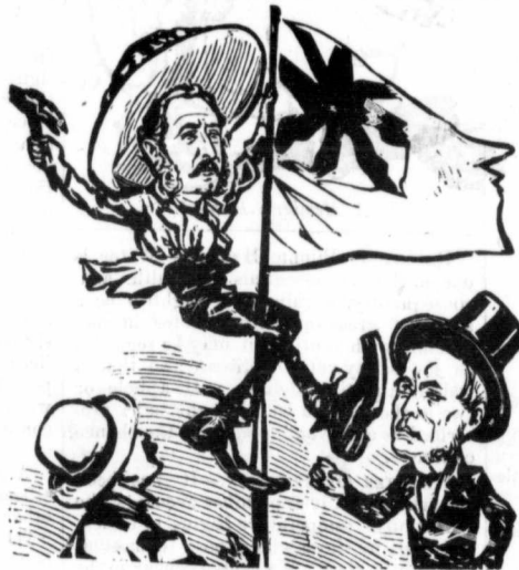
NAIL THE FLAG TO THE MAST.

The MONTREAL STAR teems with all those advertisements which the world over characterize the popular papers of great Cities. The reason advertisers patronize it so extensively is because they know that readers who want anything that is usually advertised, are sure to consult the STAR , for it.