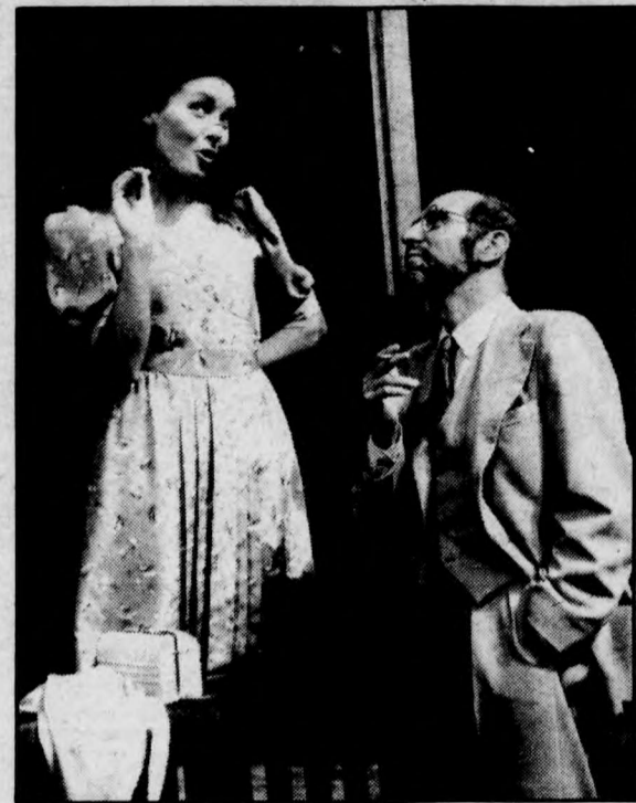
Talley's Folly St. Lawrence's fool.