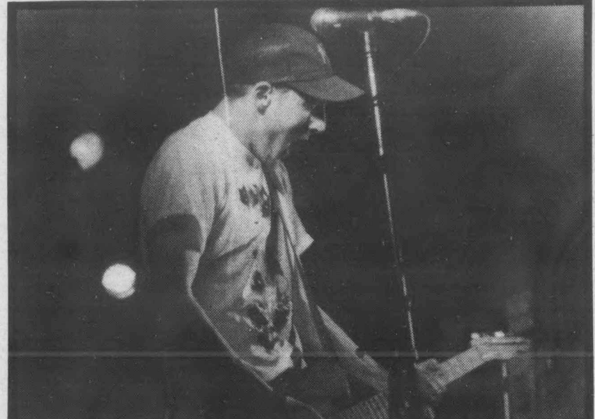
Nomeansno person aghast at the sort of things they do in the front row at Maritime rock concerts