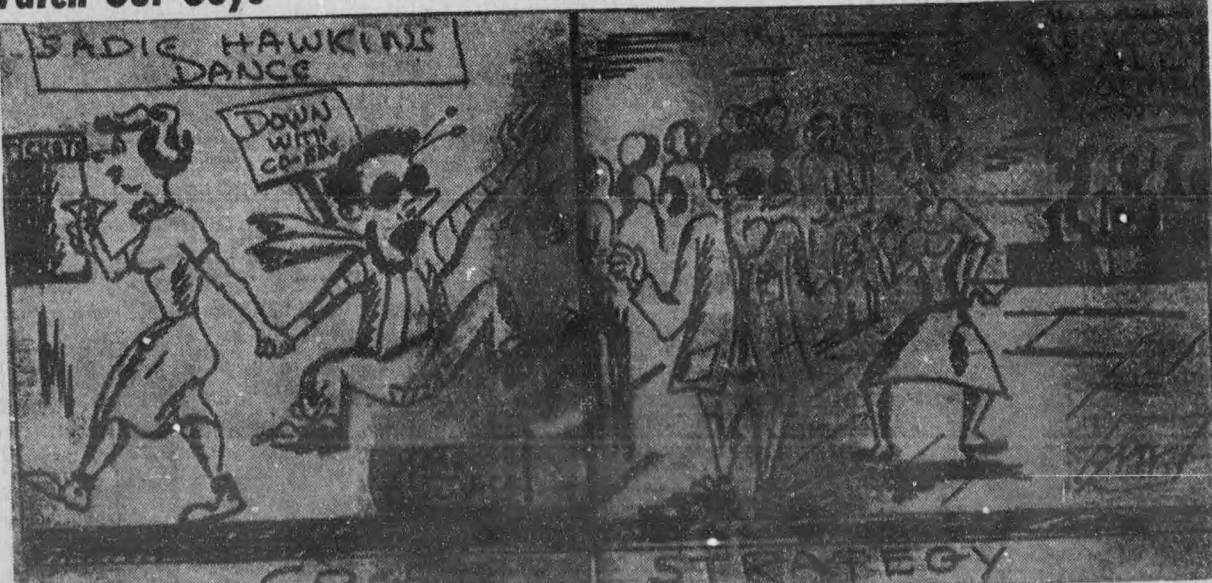
That sweet young thing who blushed and lost her self-control when she asked you to the Sadie Hawkins Dance had a method to her madness - she wants you to take her to the Fall Formal next Friday in the Gym starting at (Continued on Page 2) 9:30 p. m. and staggering until 2:00 a. m. Like, be a nice guy, and comply.