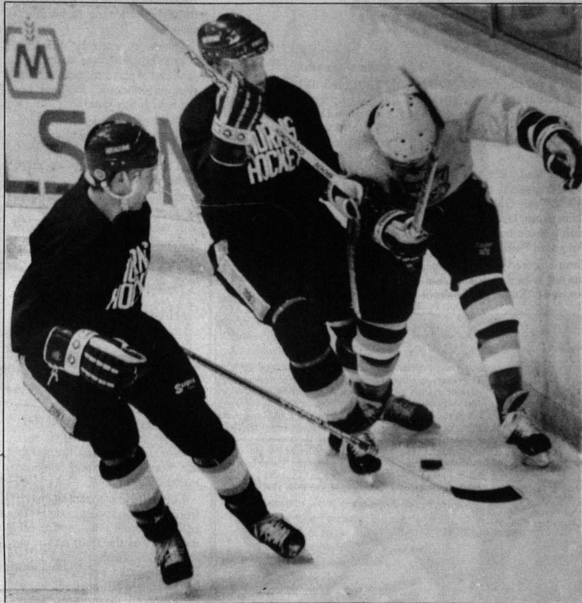
The Bears dehorned Lethbridge last week. This weekend, they travel to Brandon to face the Bobcats.