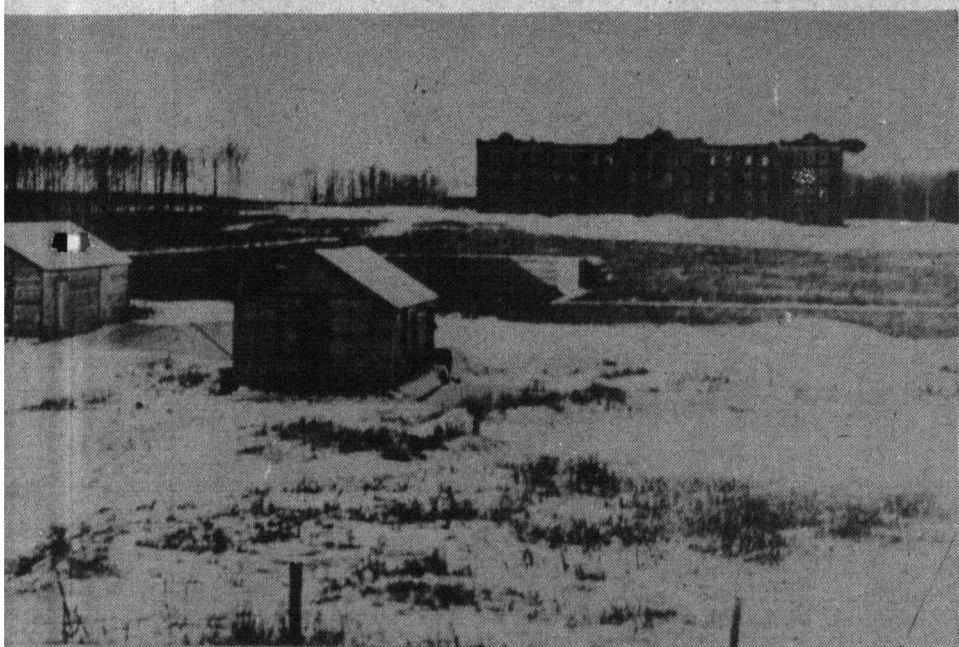
University opened its doors on 23 Sept. 1908, but didn't move to its present site until 1911, when the South (now St. Stephen's) became the focus of campus life. In 1911, Athabasca Hall was still under construction.

Forty-seven students registered for full or partial courses during the year. No University in the history of Canada began its career with so large a number of students... president's report 1908-09.