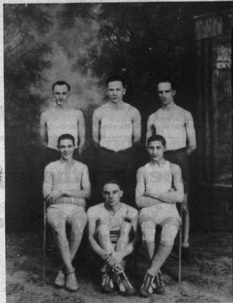
Sports lives on in its various forms on Campus. The venues have changed and the players of yesteryear are the leaders of today.

This business of the tuck, you know, has a most insidious way of worming its way into your good graces and then laughing at you when, toward the end of the month, you begin sending frantic appeals home for money... Gateway, November 29, 1920.