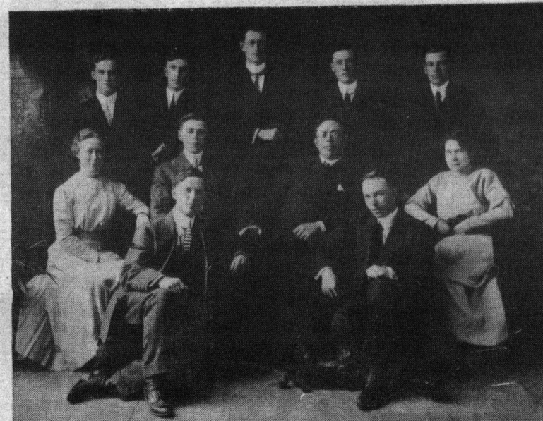
One of the first institutions established on campus was the Gateway. The paper had teething problems as it couldn't publish in its second year due to lack of funding and a shortage of staff because of typhoid fever.