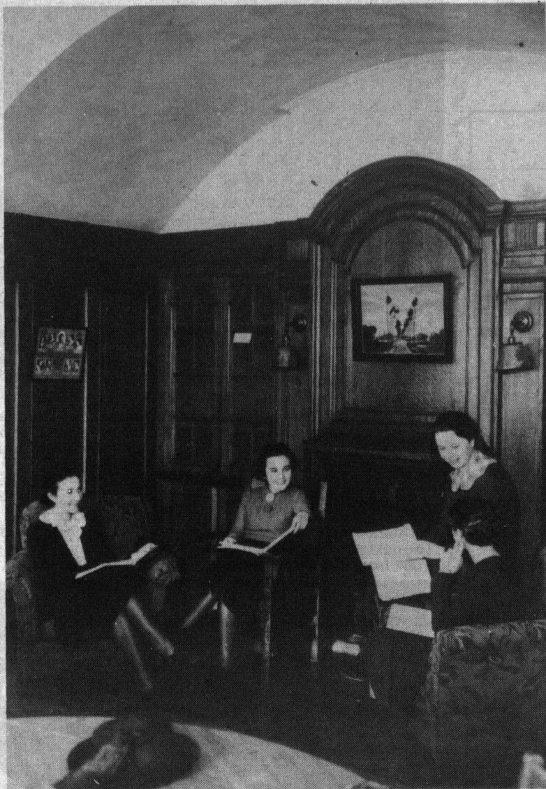
The Wauneta Room in the Arts building. The society was made up of all women students organized under a Cree motto, which once translated meant; all for one and one for all.

This business of the tuck, you know, has a most insidious way of worming its way into your good graces and then laughing at you when, toward the end of the month, you begin sending frantic appeals home for money... Gateway, November 29, 1920.