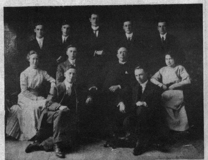
One of the first institutions established on campus was the Gateway. The paper had teething problems as it couldn't publish in its second year due to lack of funding and a shortage of staff because of typhoid fever.