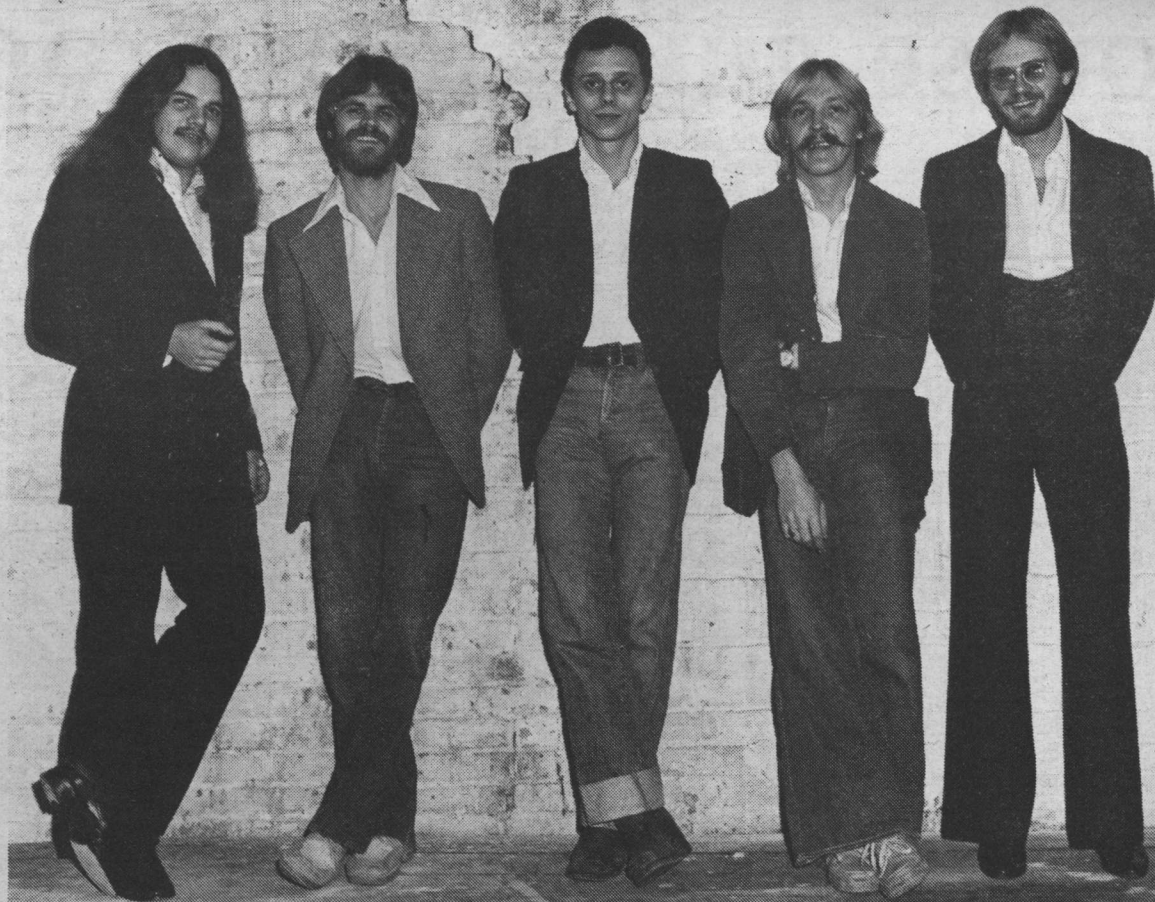
Hound Dog, Winnipeg's number one blues band will be rocking, rolling and crying the blues this Friday in SUB.

If you missed Hound Dog in September when they backed up James Cotton, here's an opportunity to see them again. They'll be giving one show at 8 p.m. Tickets are available at Mike's, SU Box Office, West Den, and at the door.