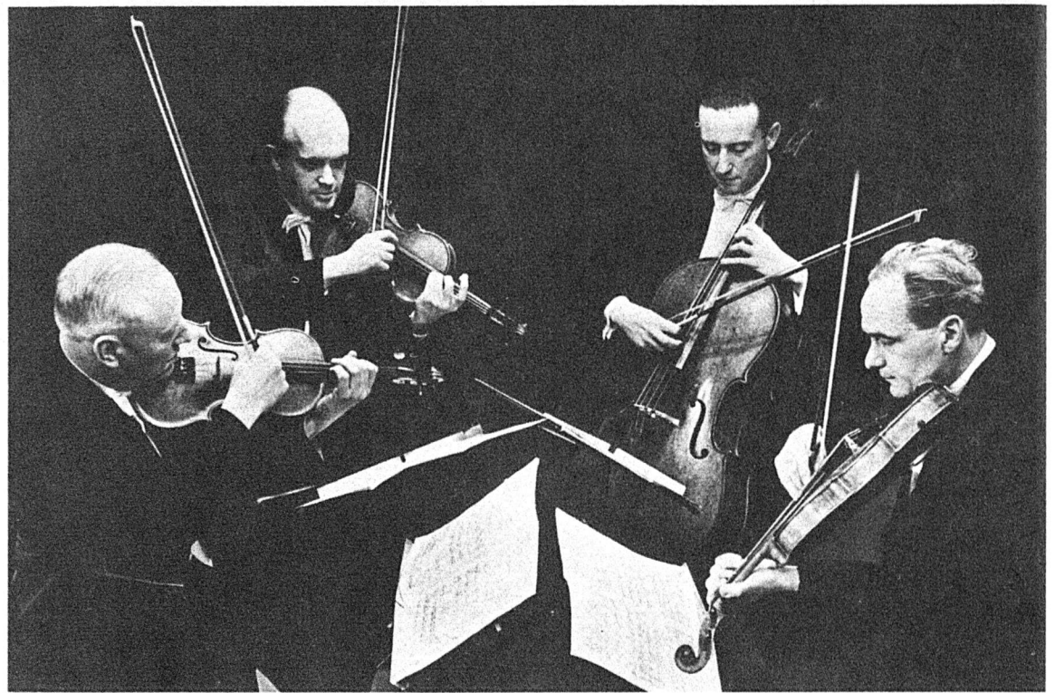
AND AT THE SIGNAL, GENTLEMEN, FIRE —These dedicated folks aren't really Mafia gangsters disguised as violinists; they're the Hungarian String Quartet, and if you join the Chamber Music Society you'll hear them perform early next January.