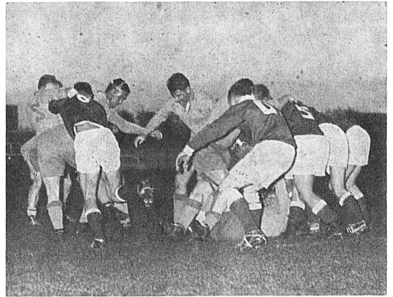
LET'S all get together and find the ball!!!