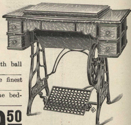
THIS CUT SHOWS EATON No. 10 WHEN MACHINE IS CLOSED

ATTACHMENTS are the best supplied with any machine, put up in a velvet lined metal box.