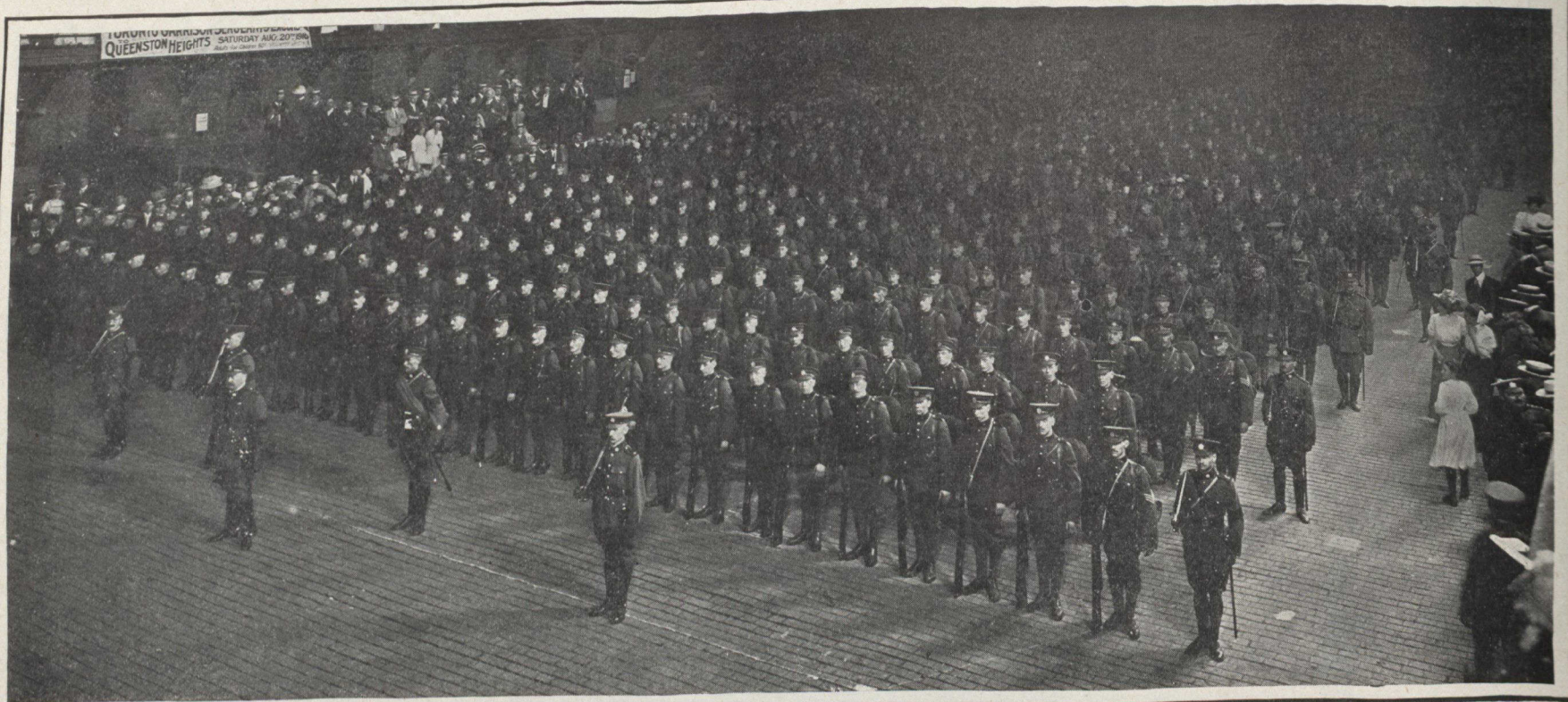
The Queen's Own Rifles ready for England This picture was taken on Saturday night, just before the Regiment Marched out of their Armoury to Entrain for Quebec.