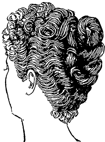
OUR WAVY and STRAIGHT SWITCHES.