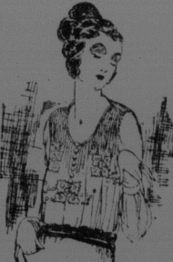
(Blouse Section, Second Floor.)

Manchester Robertson Allison Limited KING STREET GERMAIN STREET MARKET SQUARE