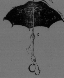
(Silk Section, Second Floor.)

SPECIAL LINE OF SILK PARASOLS Very smart colors and handles. Regular $6.50 and $7.50. July Sales, $4.95