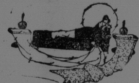
(Dress Goods Section, Ground Floor.)

All One Wonderful Bargain Price to clear . . . . . 98c. yd.