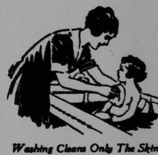
Washing Child Only The Skin

THE mother who permits constipation in her baby or older child is risking the health, even the life of her little one. It must be remembered that an infant is helpless, unable to tell that constipation is making its life miserable. Consequently the mother must be able to recognize signs of constipation in her baby. Convulsions, night terrors, grinding the teeth in sleep, feverishness, fretfulness and such symptoms—any of these may indicate that poisons from baby's stagnant intestine are flooding the little body.