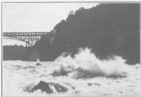
RAPIDS IN THE NIAGARA GORGE

Then, on an electric railway at the river's edge, one may travel for about an hour down the deep rocky gorge through which the troubled waters wildly dash, twisting, turning, boiling, whirling. The continuously wonderful and thrilling view of the Great Whirlpool, and of the entire course of the Rapids will never be forgotten.