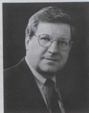
Minister of Foreign Affairs: The Honourable Lloyd Axworthy

The Department of Foreign Affairs and International Trade is the principal, but not the only, Canadian department representing Canada's international interests. We recognize that sustainable development must be integrated into the way the government defines its business and makes its decisions, and we will actively promote and support the integration and application of sustainable development in our relations with other government departments and agencies, as well as in the international forum.